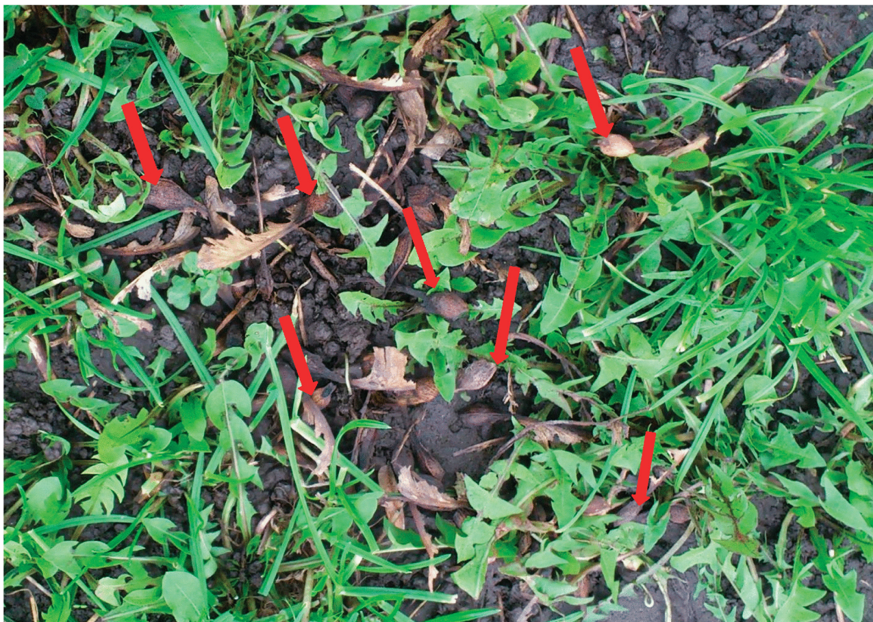
Fig 3. Pasture B. Numerous seeds found on pasture where the closest sycamore maple tree was 50 meters away from the pasture.