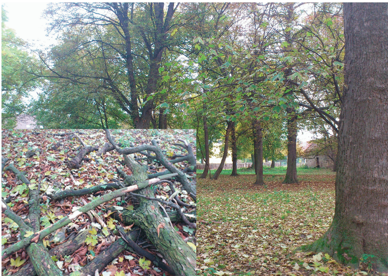
Fig 2. Pasture A: a typical AM-pasture in autumn with many trees and very sparse grassland.

There was a strong relationship between the presence of Sycamore maple trees ( Acer pseudo-platanus ) and the incidence of AM. Trees were either found right on the pasture or as in the